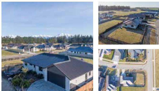
» 1 Gleniffer Place, Methven

It means working together to achieve the one thing that matters the most when buying or selling your home; the best price for you .