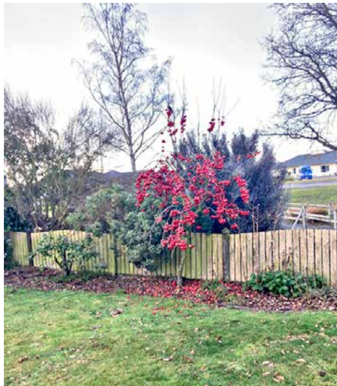
The Crabapple in my garden feeding the birds.