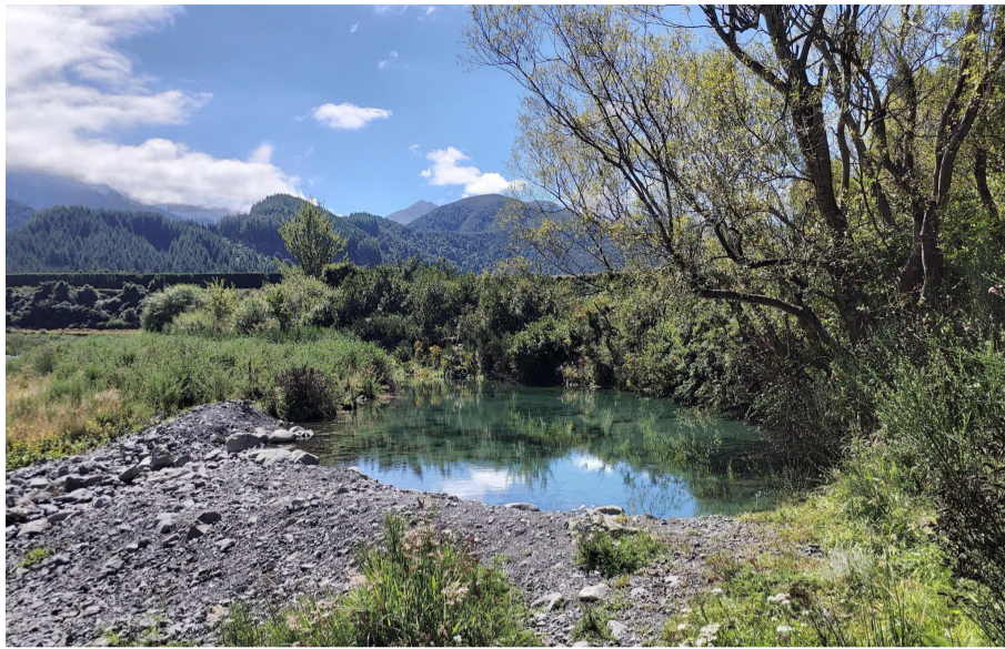
The Pudding Hill stream intake has supplied council's stockwater network.