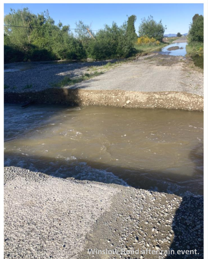
Winslow Road after rain event.