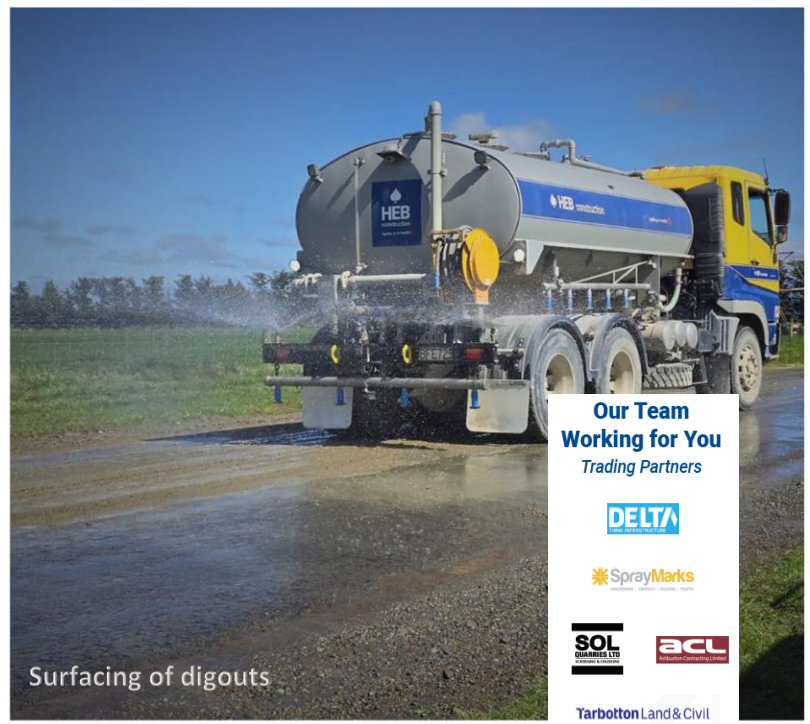
Surfacing of digouts

Our Team Working for You Trading Partners