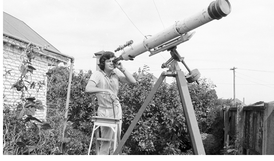
One of the photographs from a collection of Ashburton Guardian negatives, that form an exhibition about life in Ashburton in 1974.

In the gallery space, three exhibitions are in their final weeks: Tuitui Tangata,