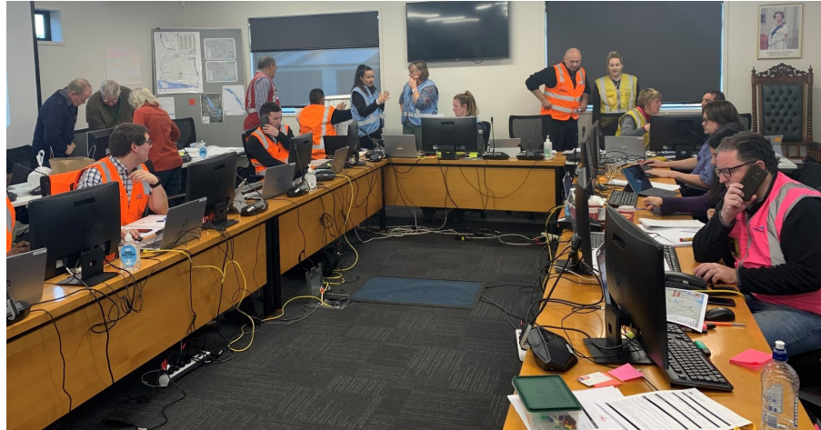
The Emergency Operations Centre during the floods of 2021.

During Pandora, the Emergency Operations Centre (EOC) at Te Whare