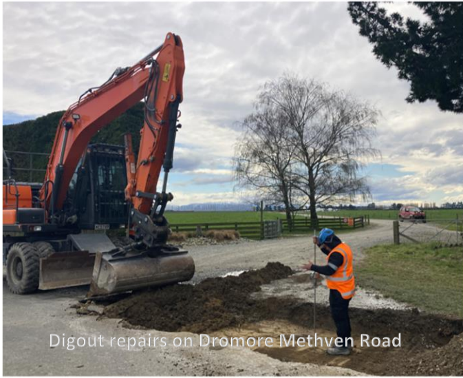
Digout repairs on Dromore Methven Road

Our supervisory team will be inspecting reseal sites to programme pre-reseal repairs and continue with all-faults and night-time inspections.