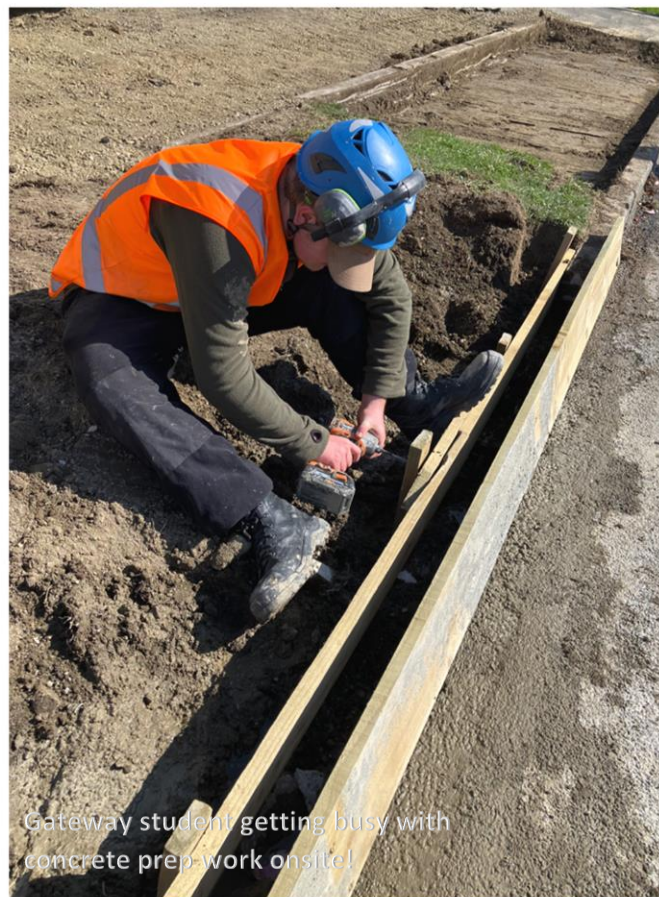
Gateway student getting busy with concrete prep-work onsite!