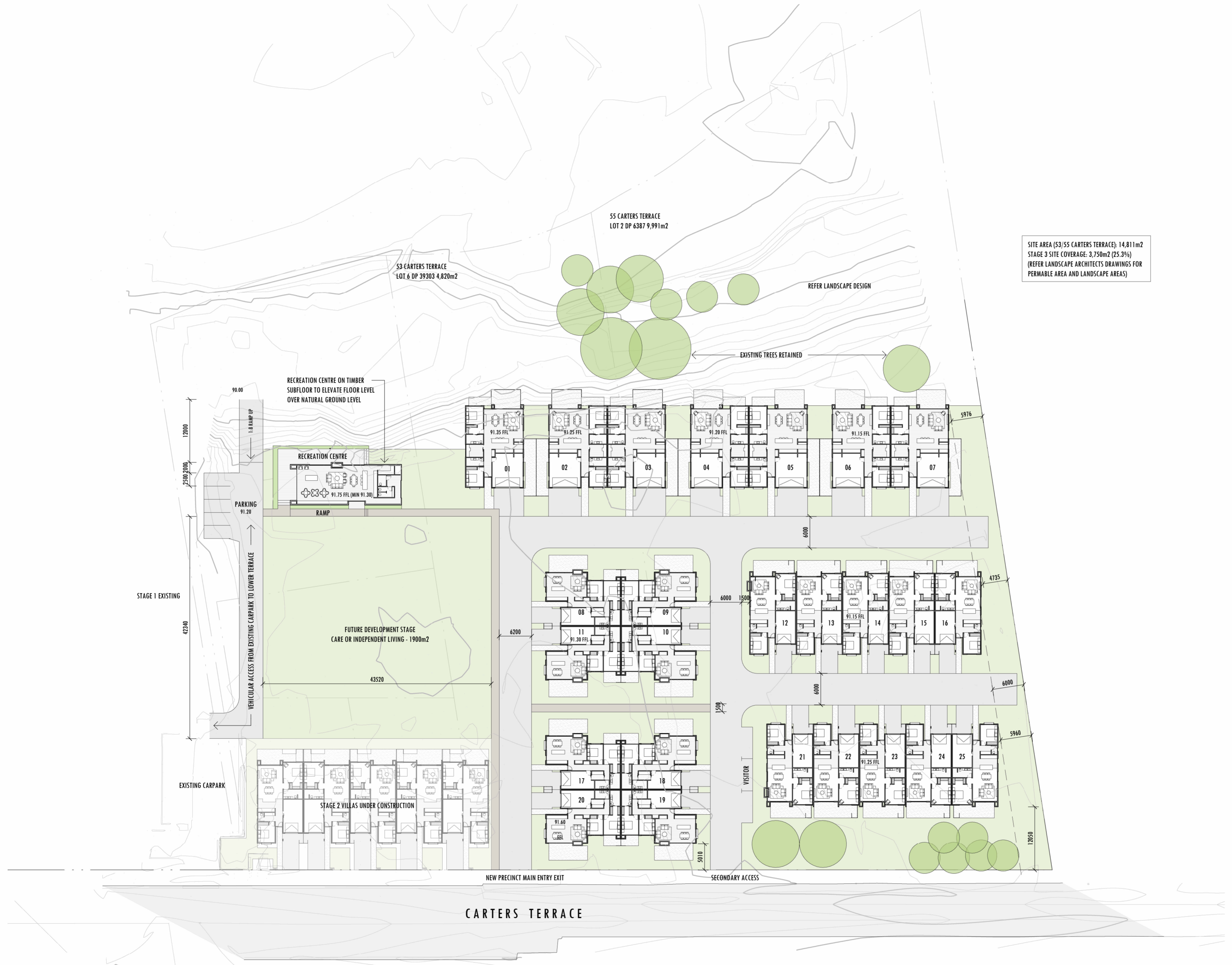
FIGURE & GROUND