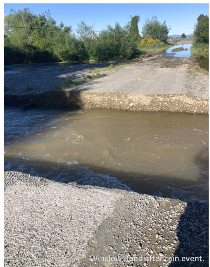
Winslow Road after rain event.